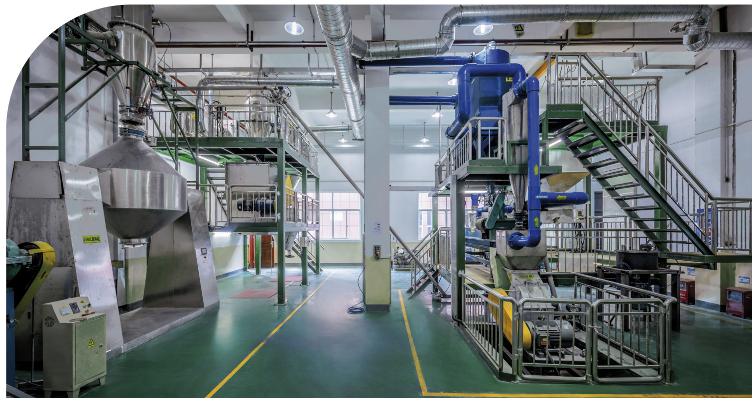
▲ Our patented sampling system for spent catalytic converters is proven to significantly reduce processing time and wastage by 6%.

BR Metals recovers an average of 2,500 kg of Platinum Group Metals and introduces them into the supply chain annually.